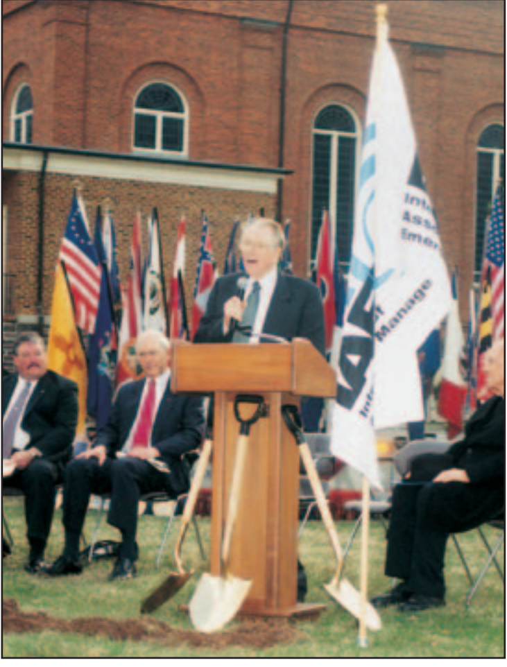
Congressman Roscoe G. Bartlett, 6th District of Maryland, welcomes the crowd.

History needs to recognize (to herald) the monumental effort and work of tens of thousands of American citizens, who, over many decades, worked part time, and full time to prepare, to warn, to protect their fellow countrymen against harm from the enemy and natural or man-made disasters. These were mostly volunteers who received little or no recognition or compensation for their work and devotion.